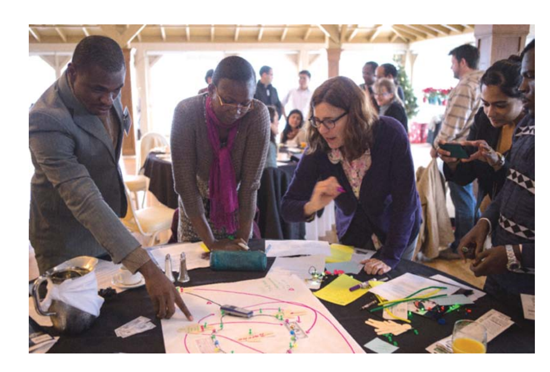
IMTFI researchers mapping mobile money social networks at the 2014 conference workshop

research suggests that insights like these can only come from engaged, qualitative research with the populations for whom such services are intended.