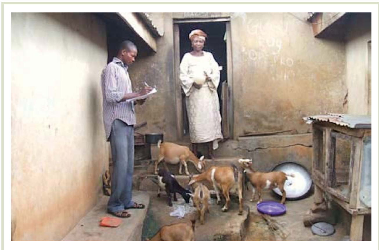
Small ruminants as sources of financial security in Nigeria

as Susu savings operations in Ghana (Osei-Assibey 2014); as well as how mobile money facilitates and extends njangi sociality and social solidarity in Cameroon (Nyamnjoh and Fuh 2014). Trust in different instruments in a monetary ecology is also a critical site of inquiry and is embedded in deep contextual histories. People in many countries of the global South have in their own or their parents' lifetimes experienced profound economic shocks, political crisis, violence and displacement, and the failure of institutions. These histories help account for why, for instance, banks may be more trusted in some countries than others. Insights from IMTFI researchers also show that people prefer to store value in gold or buy land or plant trees as more stable long term investments or in small animals or ruminants (Oluwatayo & Oluwatayo 2012).