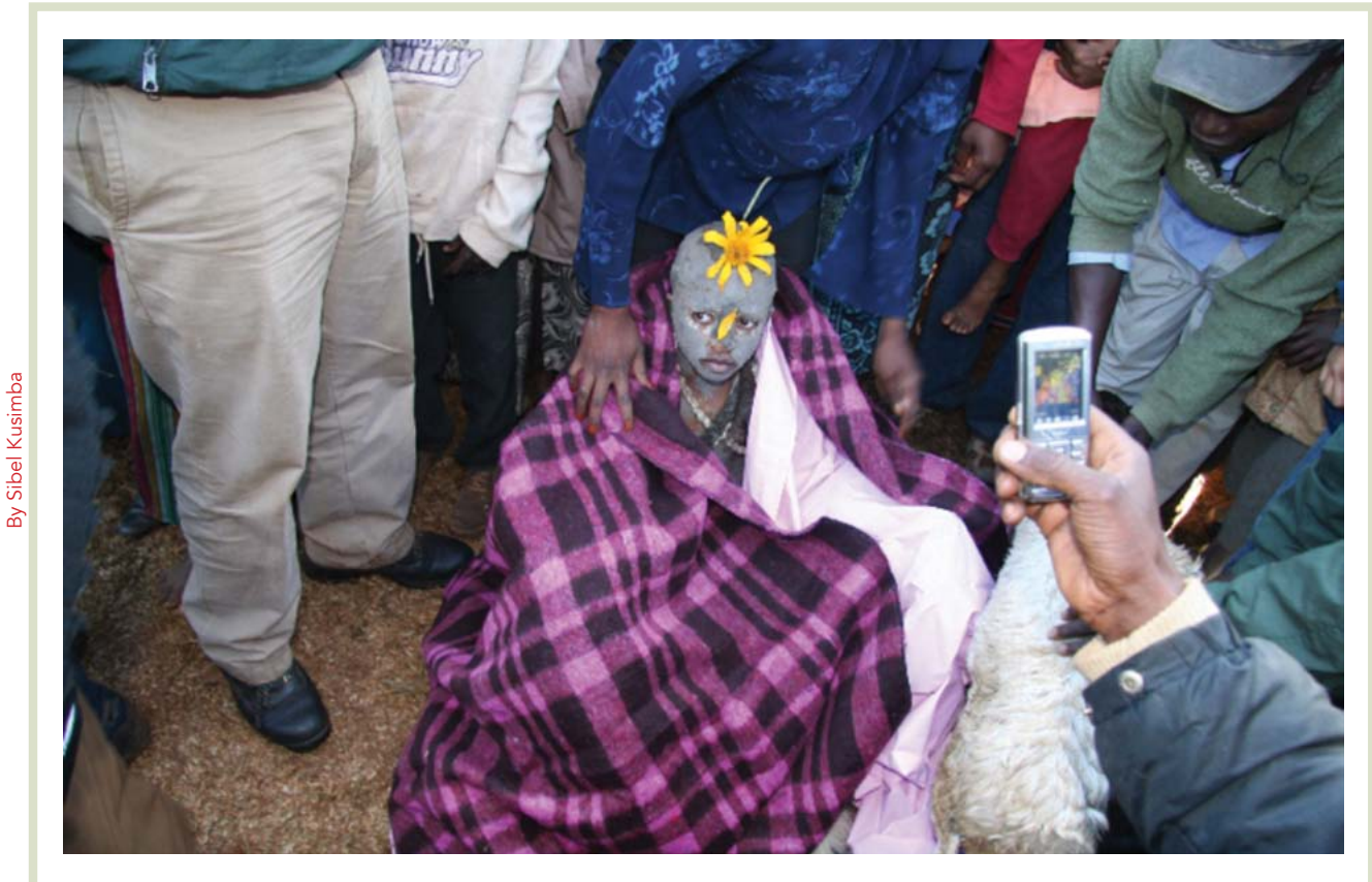
Coming of Age Ceremony in Kenya