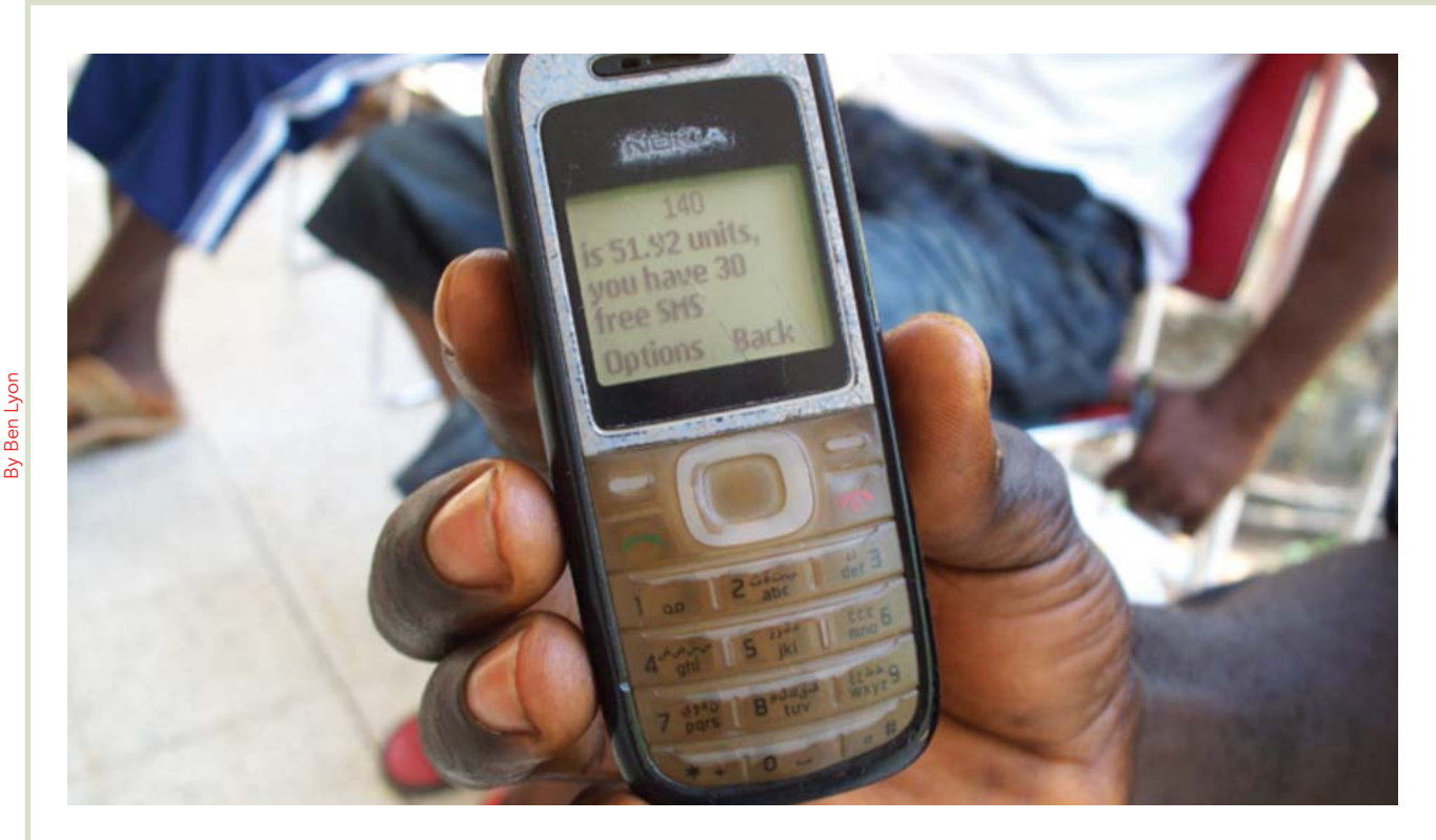
Mobile Phone with SMS credit in Sierra Leone

and technological change. IMTFI funds original research on cultures of money around the world, and it serves as a clearinghouse for research on the emerging mobile money phenomenon, as well as an archive of people's everyday socio-economic, ritual, and religious engagements with money. It issues an annual call for proposals and invites researchers from around the world to apply for small grants to support projects of 9-12 months in duration. Proposals are reviewed by a team of academics and industry experts. The process is competitive last year, only 11% of the 192 proposals received were funded. IMTFI uses this process to find researchers interested in money, mobile and technology, who can then contribute to the worldwide discussions about mobile money and financial inclusion.