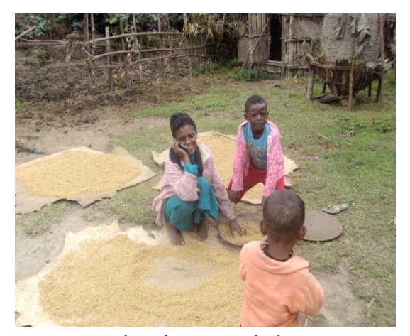
Figure 1: Sample study site in rural Ethiopia

This study focuses on the rural poor in Ethiopia. Research was conducted among the population living in an area 230 kilometers southeast of the capital, Addis Ababa. The research site has a population of more than 1000 households. These households are largely dependent on traditional farming for subsistence. Their income comes primarily from the sale of cereals and cattle. Their farming is entirely dependent on rainfall, which varies from season to season. Whenever rainfall varies in its timing and quantity, farmers' productivity declines significantly. The local population is comprised of both Christians (Orthodox) and Muslims, but this study gathered data solely from key Christian informants, from the Amhara and Oromo ethnic groups.