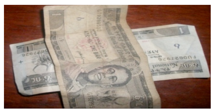
Figure 4: Special money reserved for people with power

In exchange for these services and support, beneficiaries (the clients) promise to give gifts to those in power. Common gifts of this sort include cattle (sheep), cash, local alcohol, honey, and bread. Individuals who do not have the above materials to give are expected to pay a cash equivalent of 1,500 birr, according to local respondents. If individuals promise to give cash, they keep it separately and promise not to use it for anything else. This cash and