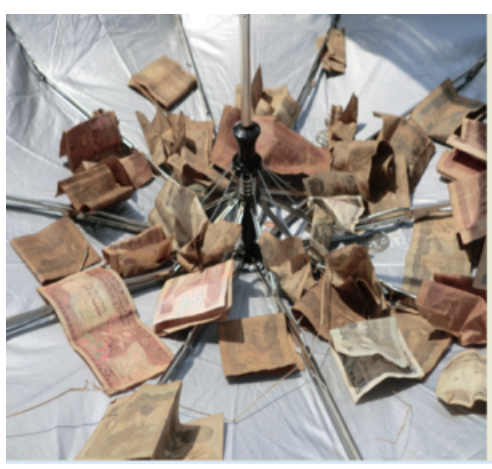
Fig. 7. Upside-down umbrella used to collect donations in money