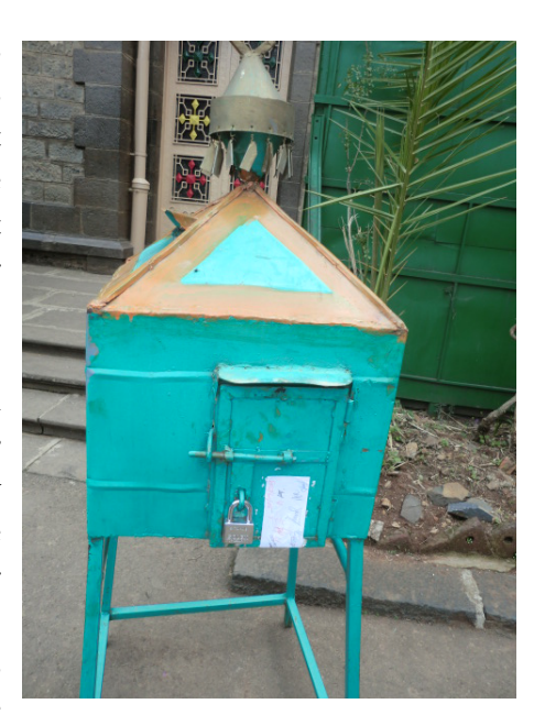
Figure 5: A mudye mitswat

Moreover, when individuals attend church over the weekend or on holidays, they place money into a designated vault called mudye mitswat (Figure 5). In principle, individuals are not to count how much they give, but in reality they know the amount to give. The reason is that, as one informant explained, "God says when your right hand gives, let your left hand not see it." Such gifts are also not recorded or memorized. In addition to cash gifts, individuals can buy and give gifts such as candles and church clothing to the churches.