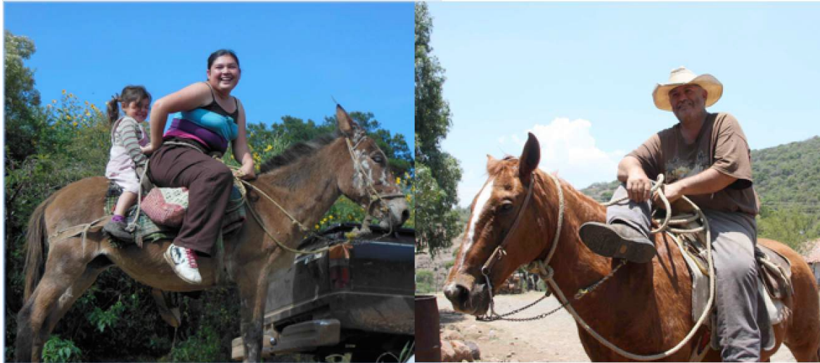
Despite their very rural setting, villagers from Sabinilla are intimately integrated into communities in Hawaii. The uncle of these girls (right) spent many years in Hawaii, as did the girls' father (not pictured).