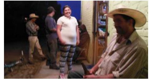
(left): After the first communion mass there is a village celebration. Many of the padrinos, the Godparents of the children, have come and they are treated as guests of honor. (right): Villagers in Sabinilla gather in front of the store at the end of the day.