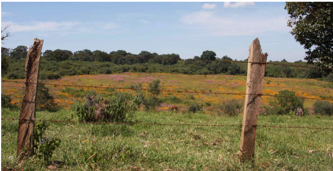
Sabinilla is located in Central-West Mexico, several hours from the nearest city.