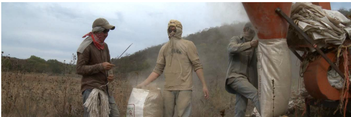
Workers in Sabinilla earn between $11 and $15 a day. Here they are grinding and bagging the dried maize, used to feed the region's dairy cattle. The work is dusty, uncomfortable and formidable.

We encountered people living multiplex realities, complying with multiple, sometimes contradictory normative frameworks. The most important eye opener for us is that, in the process, people not only manage and juggle different currencies, but they need to do so in order to make do. Those who are more adept at such juggling are the ones considered more 'successful' by virtue of their relative economic stability. Currencies, of course, are not 'autonomous' languages that spell out value equivalences. They are brought into play with each other, intertwining in the context of different social relations. They most often become interdependent, relying as they do on the social and cultural milieu within which they are embedded.