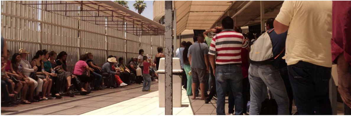
In Mexicali, many people cross the border daily for work, shopping and family relationships.

In addition, a host of transactions do not involve official money. Rather, they entail the exchange of social resources, including gifts, promises, favors, status, prestige, social links, credit, debt, etc. Such exchanges also involve social currencies. That is, people resort to particular 'languages' wherein commonly accepted value equivalences are resorted to. Some of the assets and resources involved can be considered 'social commodities'. Often, monetary devices are brought into the exchange.