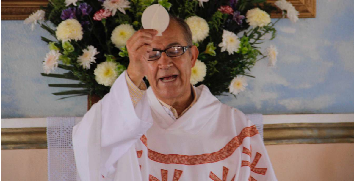
The Priest does not come regularly to the little chapel in Sabinilla. On this special day in 2015, seven children from the village had their first communion. And religion is an important element present in people's economic and calculations.