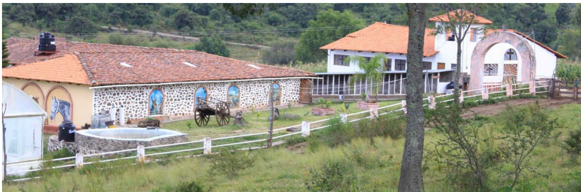
One villager, who spent twelve years working in the US, came home to buy and restore the former Hacienda in the Sabinilla.