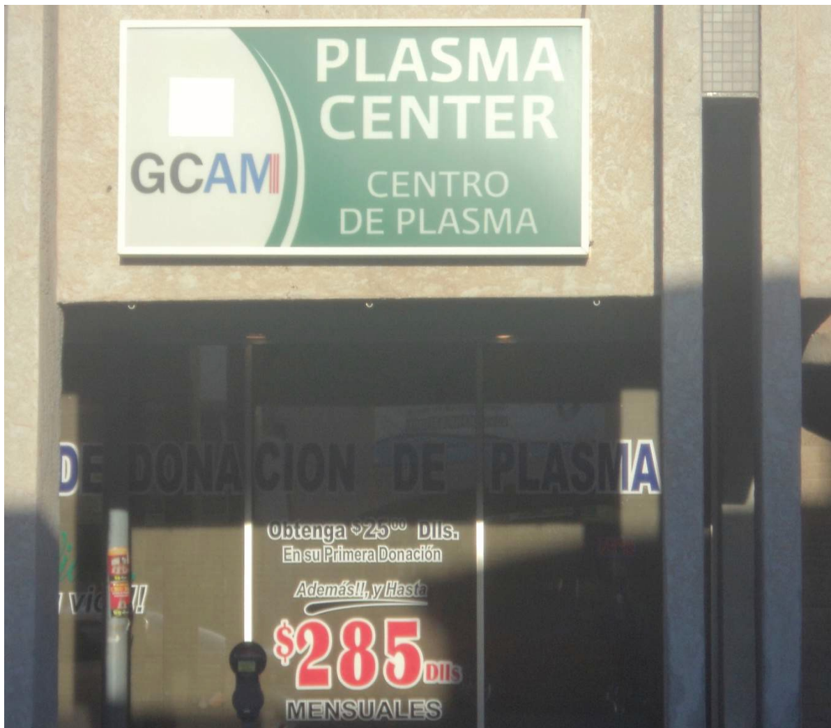
In Calexico, less than a block from the border, a US plasma purchaser advertises in Spanish.

People say they wake up to find out what the currency equivalence between the peso and the dollar is in that particular day. Crossing the borderline is also ordinary for most of the inhabitants, many of whom live and work on both sides of the border. It is common for Mexicans of naturalized Mexican Americans to live in one country and commute regularly to the other for work or other purposes. Wages, debts, taxes, savings, investments, insurance and social benefits cross the border boundary, which is not only a dividing line, but also a lived-in point of linkage, translation and communication. Some of these people live on the Mexican side of the border and work in the United States. Others live in the US (because of work or because it is a legal requirement in applying for residence or citizenship status) but their families are in