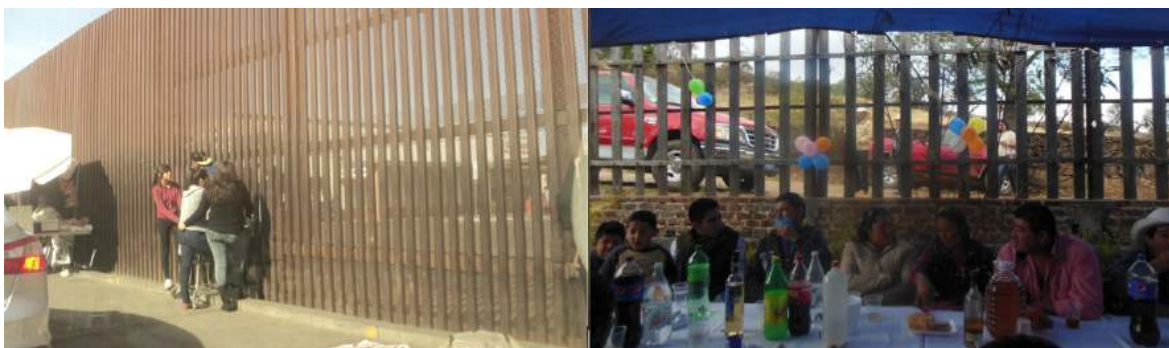
In Mexicali (left) cross border communications are often conducted directly through the fence. In Sabinilla (right) migrants often come home for village celebrations such as this baptism.