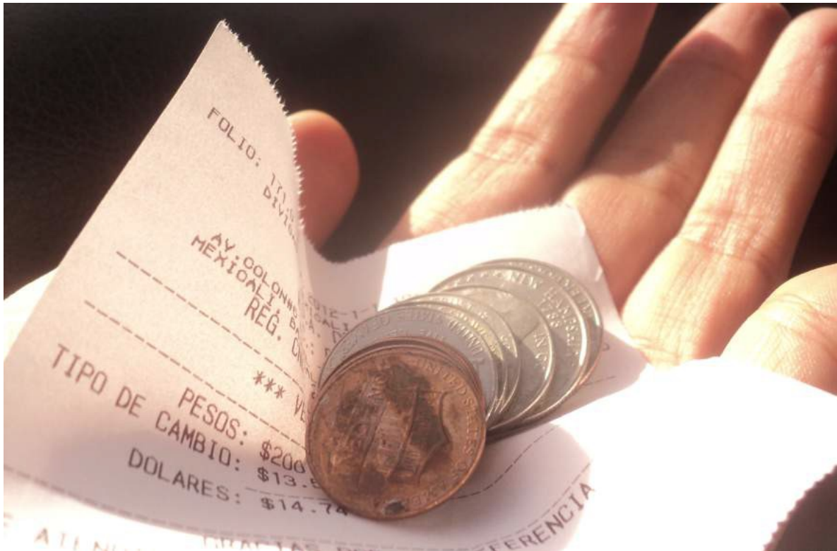
The money exchanges on the border give exact change, and as research Lya Niño notes, "everyone lives with one eye fixed on the exchange rate."

"Earmarking currencies is one of the ways in which people make sense of their complicated and sometimes chaotic social ties," Zelizer writes (1997, p215).