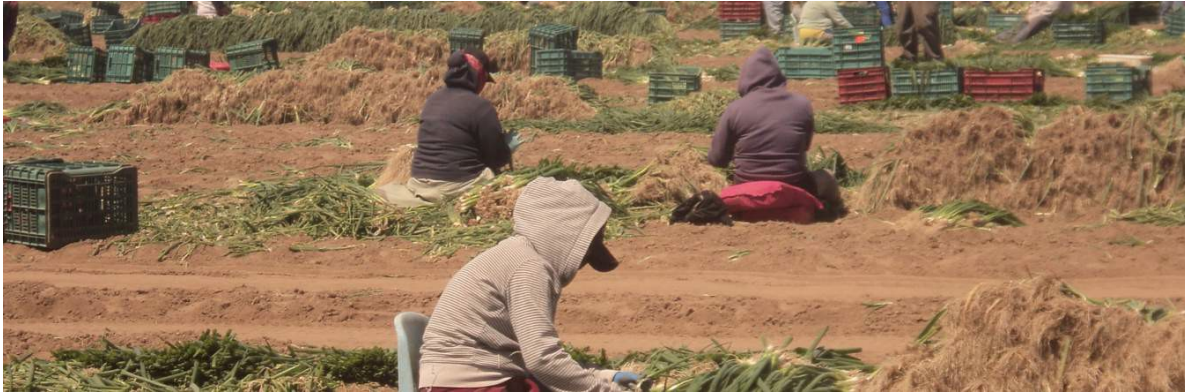
Many workers from Mexicali cross the border daily (or nightly) in order to work in the fields of California. Here, women harvesting and sorting chives.