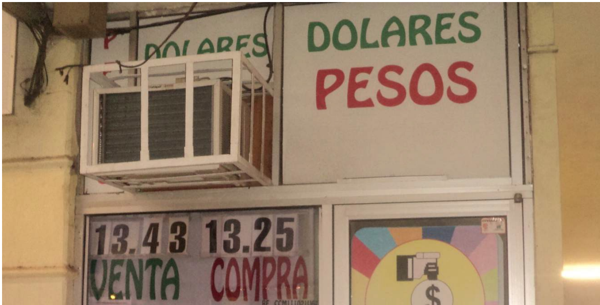
Exchange Centers are a common sight on the Mexicali-Calexico border.