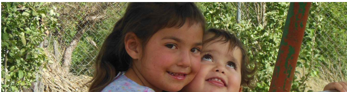
The daughter of a villager and the daughter of the researcher play together in Sabinilla.

Whereas Mexicali was historically inhospitable due to its arid dry hot conditions and was only developed in the 20 th Century as an agricultural region, Sabinilla is the wild ranchlands high in the mountains with almost five centuries of history as a dairy cattle region ruled by roving bands of thugs, rich barons. While Mexicali has its cactus, sage and border controlling bandits, the region around Sabinilla is pine and olive trees and drug traffickers. Yet, despite their differences and the distances separating them from each other, these two communities share the fact that large portions of their populations leave to live and work in the US.