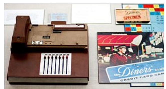
Financial products and services have changed drastically over time. These Farrington credit card imprinter #1500 and Diner's Club board game were displayed in the exhibition "Gold to Gigabytes: The Past, Present and Future of Money" by the IMTFI.

When we begin a research project, we all have to consider a diverse range of possibilities and decide where to draw our parameters.