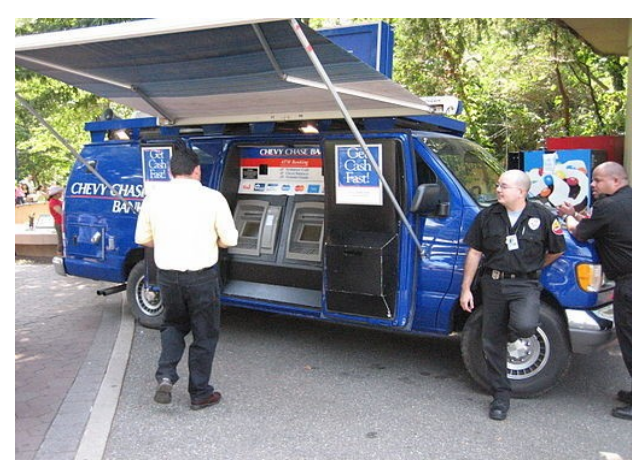
Mobile ATMs in a van.

Services such as these are integral to the transformation of consumer finance from something that happens within domestic markets, defined by national borders, to a practice that integrates people, providers, and regulatory bodies around the globe.