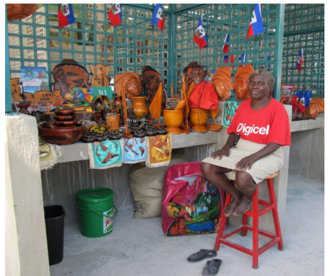
Digicel are using their popularity to promote their mobile money service in Haiti. Photo taken in the Iron Market, Port-au-Prince.

This potentially gives Digicel an edge when it comes to expanding their services into consumer finance, so long as they can solve the problem of information.