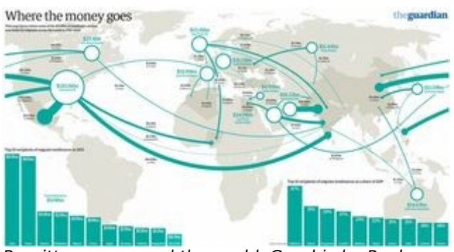
Remittances around the world.

In alternative finance, we have seen the development of Bitcoin, the Brixton Pound, and crowdfunding, to name but a few. And the 2.5 billion people who lack bank accounts are not without services either: even when few or no formal financial providers are available or accessible, they use a wide range of informal savings, credit, and insurance services.