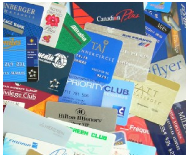
A range of credit and store cards.