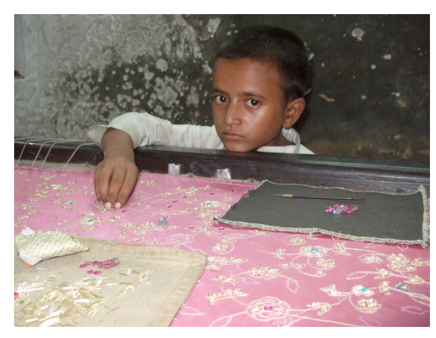
fig 1. A six year old child is seen working on a bridal dress. He is paid around Rs 50 ($1.04) per week.

With the end of the feudal era the demand for this type of embroidery fell but it has continued to remain a part of the Shia culture of Lucknow. During the last three decades one has witnessed a resurgence in the production of Zardozi embroidered clothes after their induction as ethnic couture in the bridal wear, fashion and glamour industry of India and abroad. This has created a huge local demand and an export boom to the Middle East and Europe, along with creating an extraordinary inclination within the Muslim community towards learning this art from their predecessors. The migration of Zardoz from Lucknow to Saudi Arabia and Dubai has also been a common phenomenon since then.