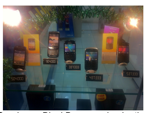
Images from a shopping mall in Surabaya: BlackBerry predominating and associated with cutting-edge devices. The rupiah exchanges for approximately 1 US$ = 9,500 Indonesian rupiah.