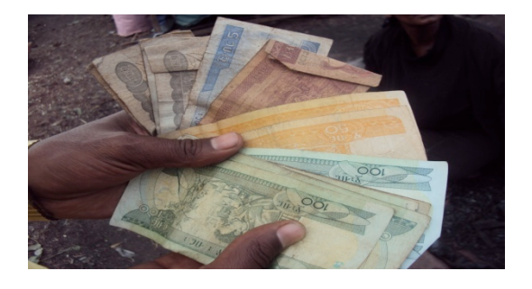
Figure 1, individuals sort and identify currency notes based on color

Both sellers and buyers, with no formal education, identify bank notes based on their color. These individuals cannot write or read any numbers and cannot make any mathematical computations by writing. But, for example, they know the sum of 10 birr<sup>2</sup> and 5 birr will give 15 birr and yet do not know how to spell these numbers. If asked to pickup say a 50 birr note from a lump of other notes with different denominations, they easily identify the value through the color of the notes. Thus, it could be said that the color of money notes is a means to identify currencies as well as for mathematical computations.