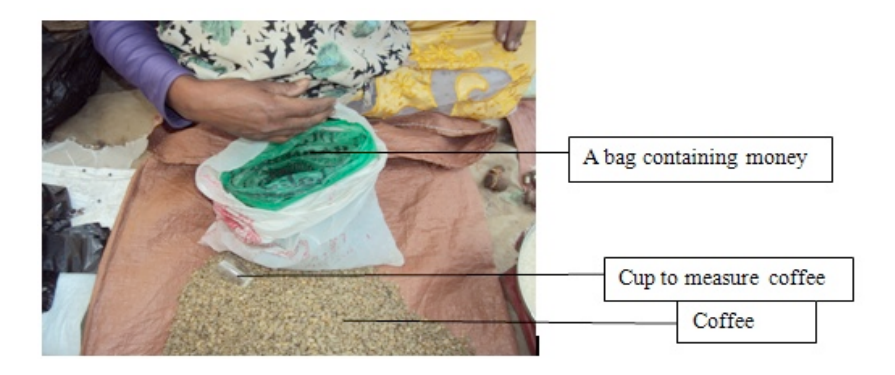
Figure 2: Use of single money bag

Retail merchants engaged in selling items like charcoal, fruits & vegetables, clothes, and cereals as well as sellers in the animal market, prefer to use single common money bags. They confirmed that the use of a common bag has advantages such as that it is convenient to control and manage money, that it reduces the problem of too much change during a transaction, avoids loses as the result of putting money here and there in different bags and in the case of a mass conflict in the market, it is easy to collect and run away with the money. But, it also has some limitations (according to the respondents) for example, when money is in one bag it attracts thieves and violence. It is also difficult to know how much profit was taken from each item.