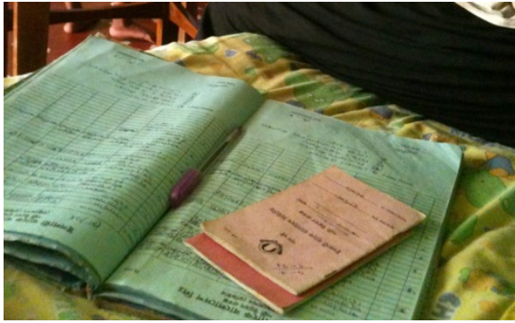
A client passbook and bank ledger, detailing RDS accounts (2013)