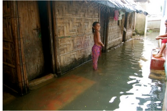
Zinukpara's residents suffer from home floods (and resulting sickness, property damage, and suffering) during the monsoon season, due to its proximity to the Bay of Bengal.