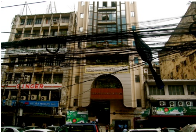
The Islami Bank Bangladesh Limited headquarters, Dilkusha, Dhaka, Bangladesh (2010)

Bangladesh, a deeply impoverished nation of nearly 160 million with the world's fourth-largest Muslim population, has a rapidly growing Islamic finance industry, anchored by its oldest Islamic bank, the Islami Bank Bangladesh Limited (IBBL). IBBL is one of Bangladesh's largest banks, offering commercial and consumer financing, tremendously popular remittances services for migrant workers, and an Islamic microfinance program for the rural poor, the Rural Development Scheme (RDS). Since its inception in 1983, the Islami Bank has described itself as a religious as well as financial institution dedicated to poverty alleviation—an identification often invoked by employees during our conversations. In addition to the regulatory, staffing and monitoring structures to ensure the Shari'a compliance of IBBL's operations, 2 its expansion strategy, corporate culture, and the semiotics of its branding and marketing reinforce IBBL's status in Bangladesh as an Islamic institution. My PhD dissertation is an ethnography of finance, Islam, and poverty that explores the theoretical registers of Islamic (micro)finance client experience and institutional management threaded through the money, policy, and influence connecting Saudi Arabia to the Bangladeshi capital of Dhaka to a small-town slum tucked along the Bay of Bengal.