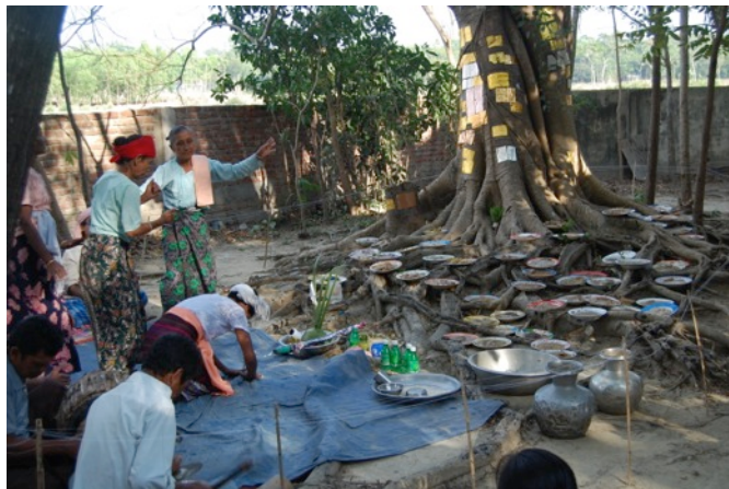
A Rakhine puja for improved job opportunities and financial success (2014)

Zinukpara, a mixed Muslim, Hindu, and Rakhine community, is adjacent to both a small town and vast expanses of rural, riverine lands used for agriculture and pisciculture. Residents referred to Zinukpara with the English loan word colony ; friends of residents living outside it called the community a bosti (slum). Residents were proximate to schools and hospitals, but typically could not afford them. Local NGO resources and government services focused largely on coastal cyclone victim relief and service provision in the two UN-run Rohingya refugee camps.