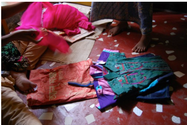
Children's clothes purchased for Eid ul Fitr are displayed; social pressures make Ramadan and Eid periods of financial insecurity (2014).