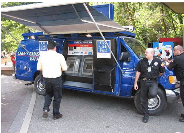
Mobile ATMs in a van.

Services such as these are integral to the transformation of consumer finance from something that happens within domestic markets, defined by national borders, to a practice that integrates people, providers, and regulatory bodies around the globe.