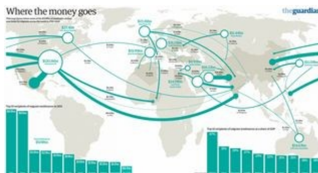
Remittances around the world.

In alternative finance, we have seen the development of Bitcoin, the Brixton Pound, and crowdfunding, to name but a few. And the 2.5 billion people who lack bank accounts are not without services either: even when few or no formal financial providers are available or accessible, they use a wide range of informal savings, credit, and insurance services.