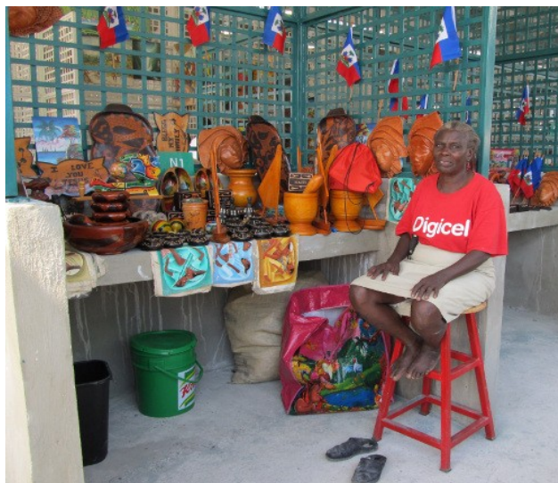
Digicel are using their popularity to promote their mobile money service in Haiti. Photo taken in the Iron Market, Port-au-Prince.

This potentially gives Digicel an edge when it comes to expanding their services into consumer finance, so long as they can solve the problem of information.