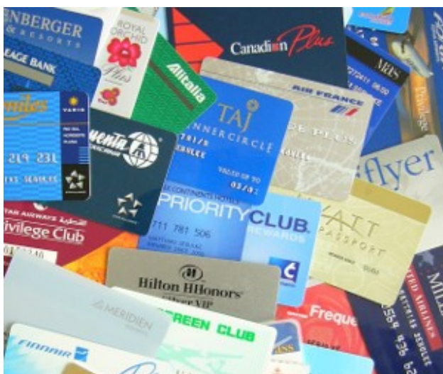
A range of credit and store cards.