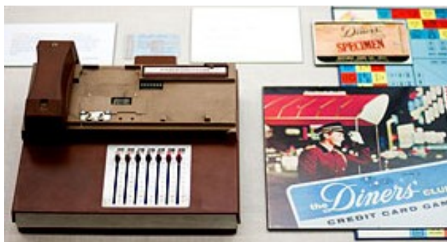
Financial products and services have changed drastically over time. These Farrington credit card imprinter #1500 and Diner's Club board game were displayed in the exhibition "Gold to Gigabytes: The Past, Present and Future of Money" by the IMTFI.

When we begin a research project, we all have to consider a diverse range of possibilities and decide where to draw our parameters.